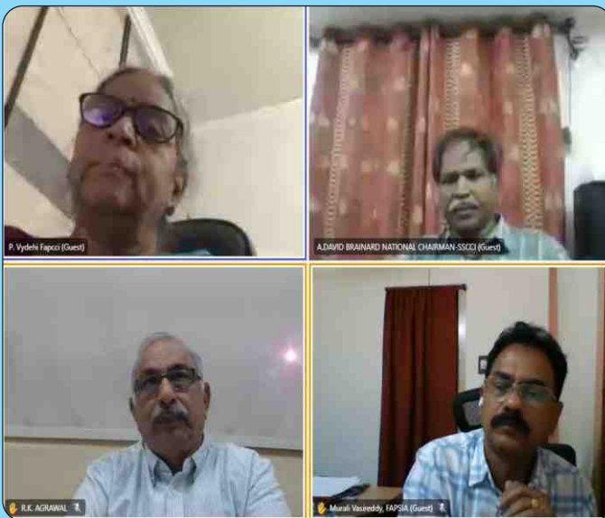
Stakeholders Consultation on draft Viksit AP plan 2047 for Secondary sector, 7 March 2024