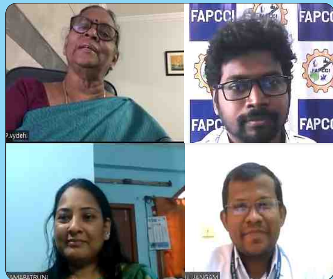
Export Business & Procedure and Documentation program on 7 - 9 Feb 2024