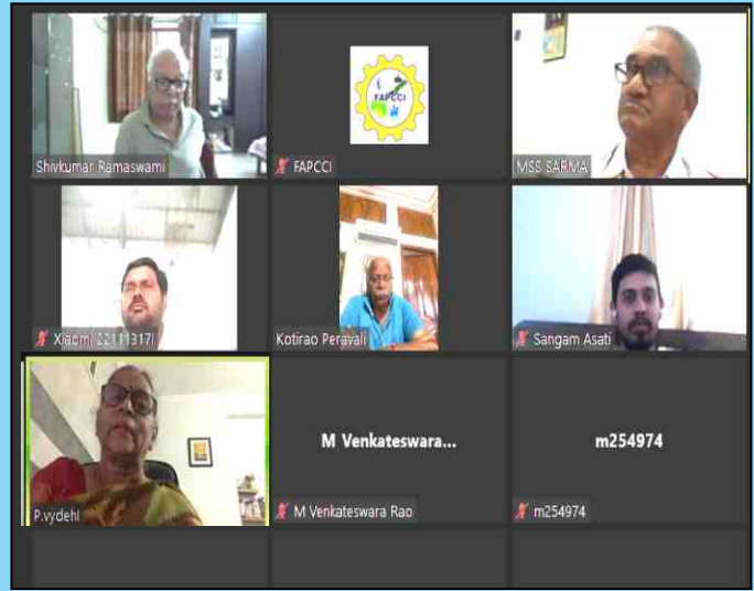
Discussion meeting on power issues affecting trade and Industry, 16 March 2024