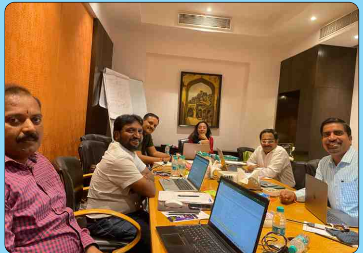
ILO Training of Trainers Meet on 31st Aug 2023 & 1st Sep 2023