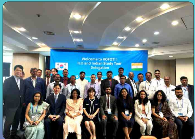
Study Tour of Indian Delegation to Republic of Korea, 3rd July to 8th July 2023