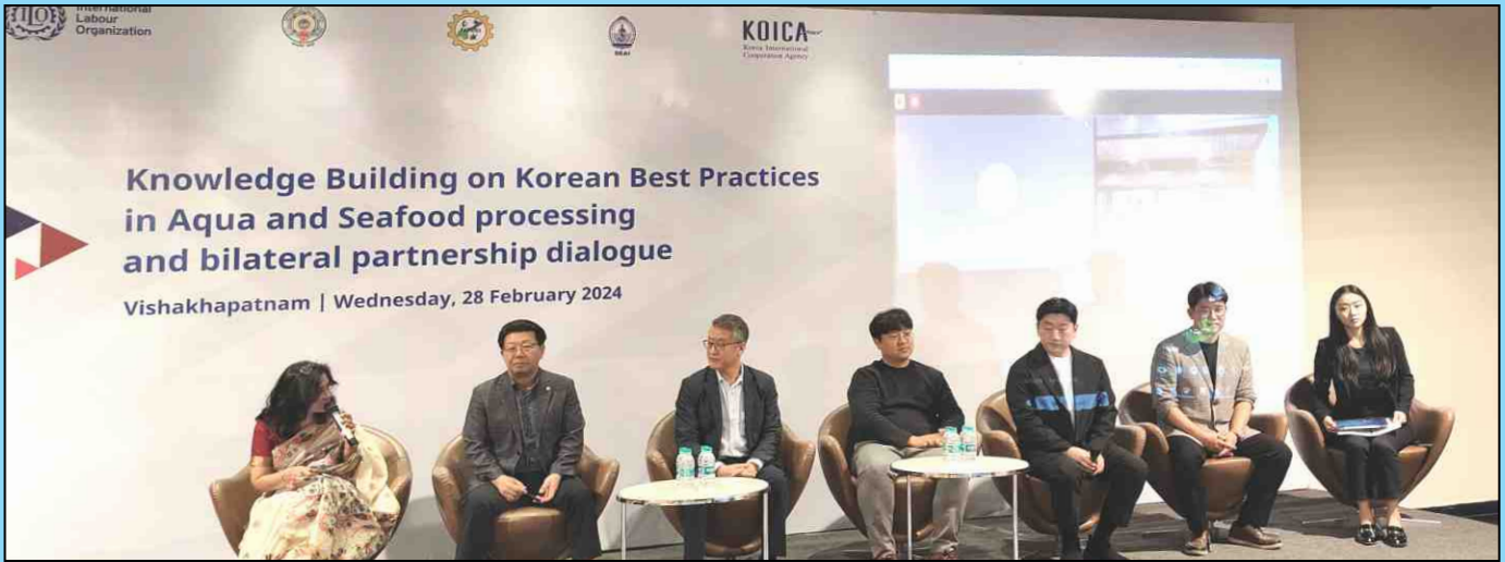
Knowledge Building on Korean Best Practices in Aqua and Seafood processing and bilateral partnership dialogue, 28th February 2024