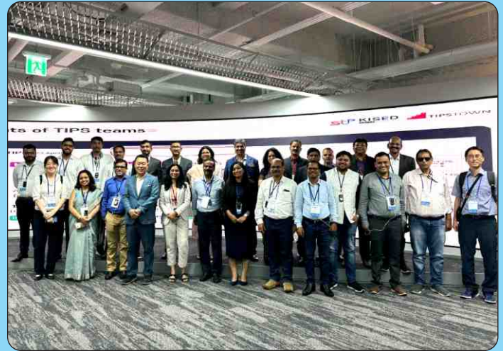
Study Tour of Indian Delegation to Republic of Korea, 3rd July to 8th July 2023