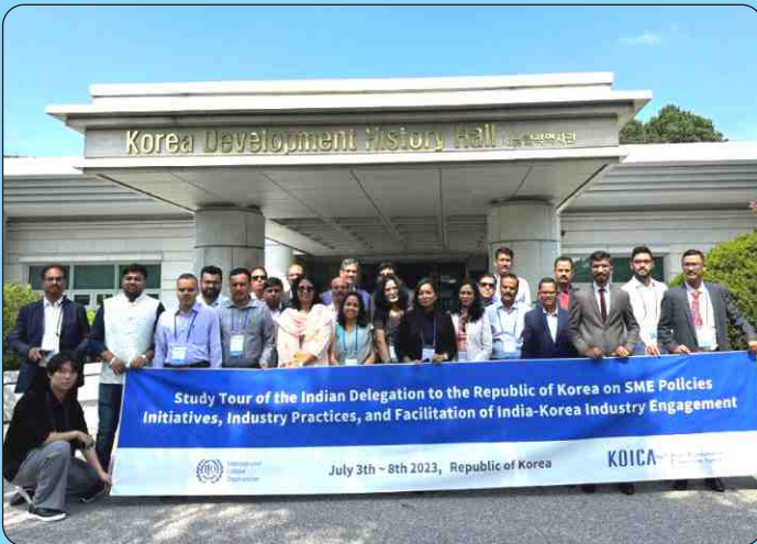
Study Tour of Indian Delegation to Republic of Korea, 3rd July to 8th July 2023