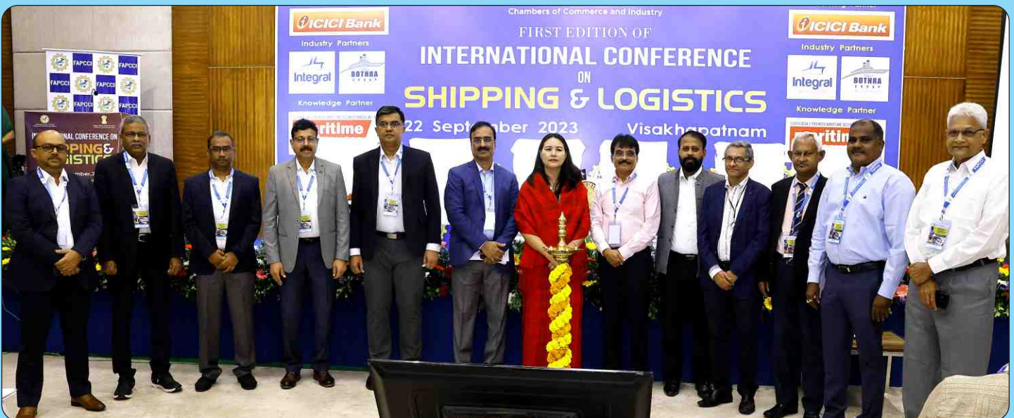
International Conference on Shipping & Logistics, 22nd Sept 2023