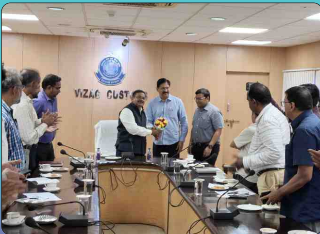
Interactive session with Principal Commissioner of Customs, Vizag