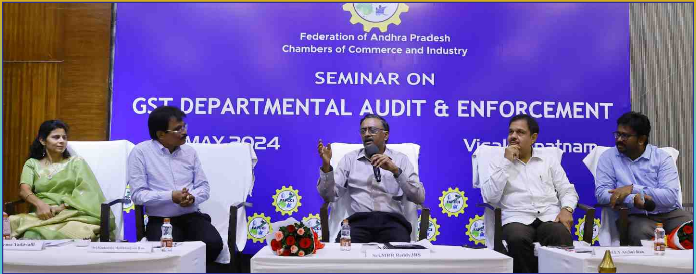
Seminar on GST Departmental Audit & Enforcement, 4th May 2024