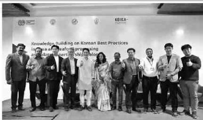
FAPCCI workshop in Veda on seafood exports to South Korea

EXPERTS from the trade and industry in Andhra Pradesh have sought efforts to increase export of seafood from the State to South Korea through collaborations on knowledge sharing and Free Trade Agreement (FTA).